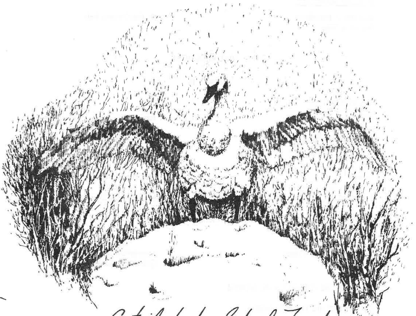
A tribute to Edsel Ford